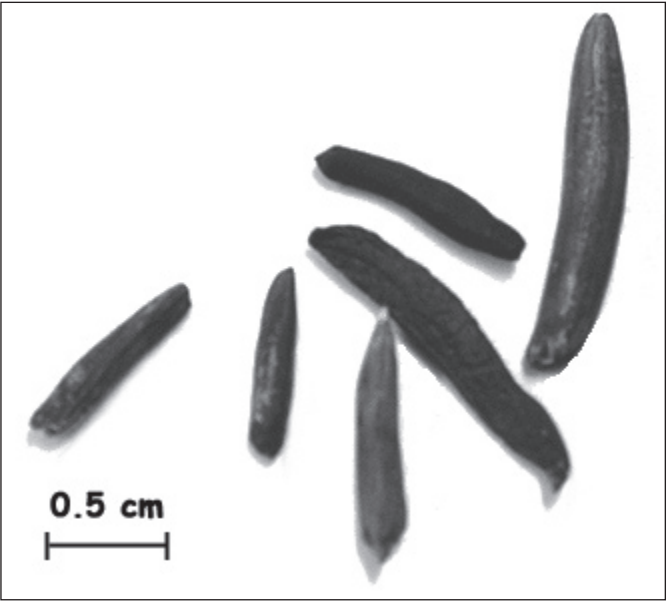
Fig. 2 Ergot sclerotia

In gangrenous ergotism, people experience nausea and pain in the limbs. Quite often bodily extremities turn black, dry, and become mummified, causing the infected limbs to spontaneously break off at the joints. Spontaneous abortion also occurred frequently. The initial burning sensation led to the Latin name "ignis sacer", which means Holy Fire. This human malady was