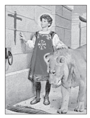
Fig. 5 Saint Vitus