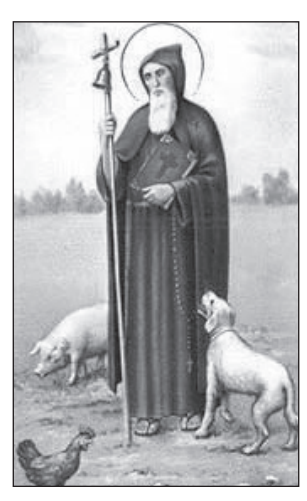
Fig. 4 Saint Anthony

This topic – the temptation of St.Anthony – was used many times by numerous later painters, including S.Dali and others.